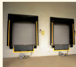
Rolling Service Doors