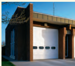
Thermacore® Sectional Doors