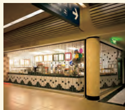
Rolling & Side Folding Security Grilles & Closures