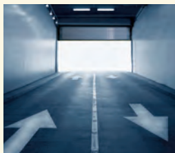
Advanced Rolling Steel Door RapidSlat®