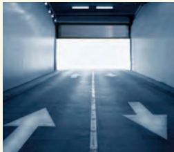
Advanced Rolling Steel Door RapidSlat®