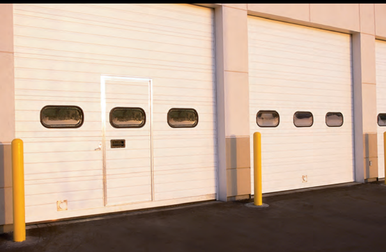
Series 591 with passdoor and thermal glazing.