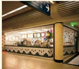
Rolling & Side Folding Security Grilles & Closures