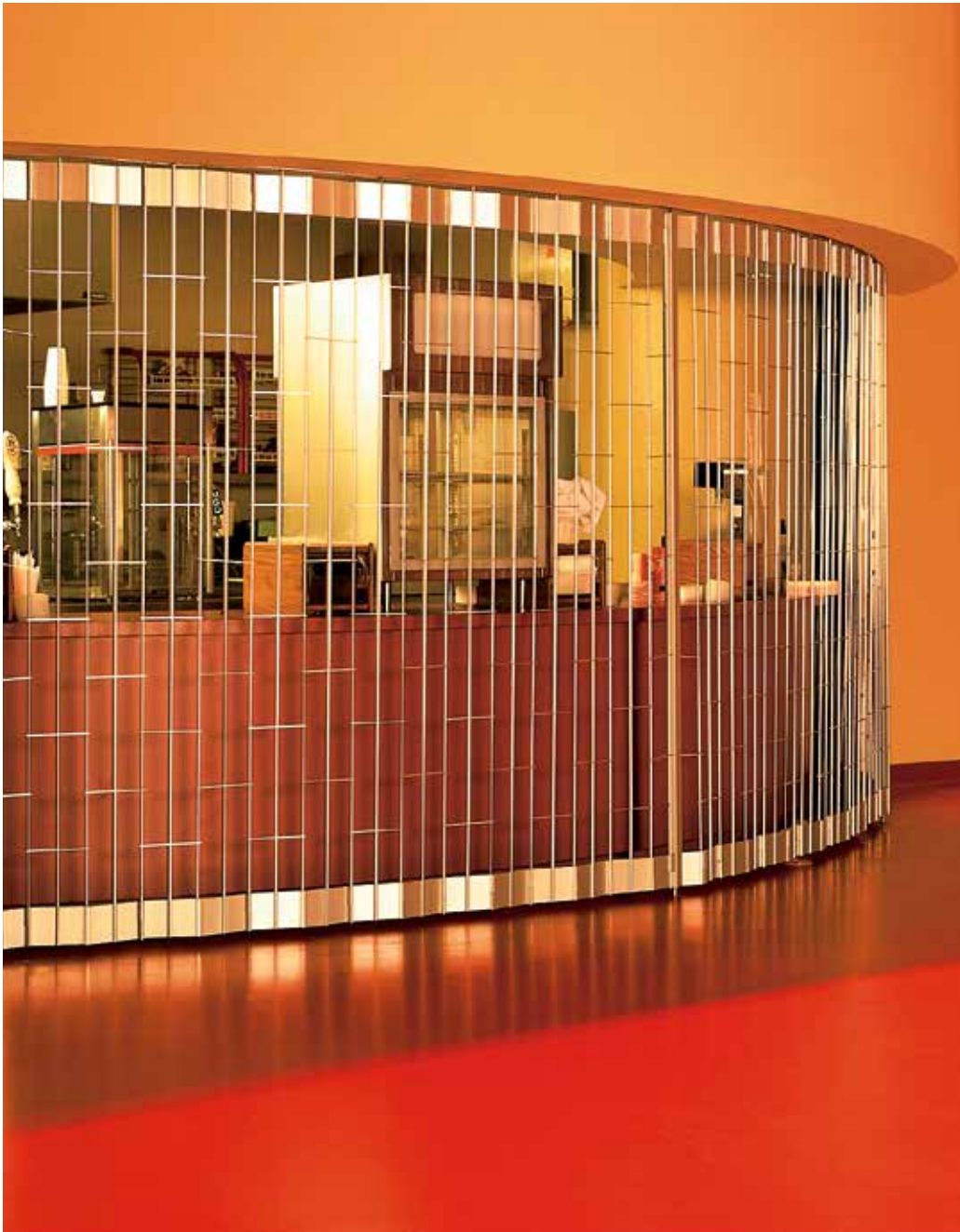
681 side-folding open air grille. Installation and service: Overhead Door Company of Madison.