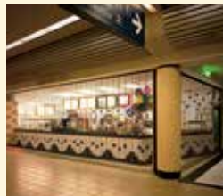
Rolling & Side Folding Security Grilles & Closures