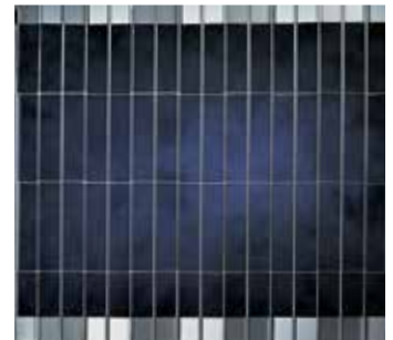
683, Straight Pattern