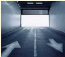
Advanced Rolling Steel Door RapidSlat®