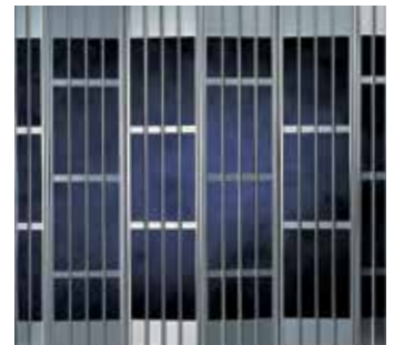
681, Brick Pattern