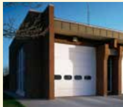
Thermacore® Sectional Doors