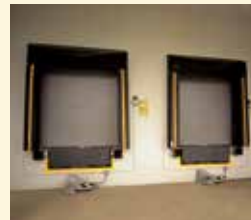
Rolling Service Doors